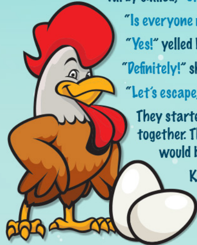
Answer: Roosters don't lay eggs.